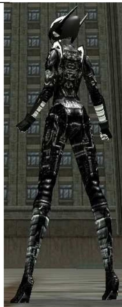
Screenshot from City of Heroes.